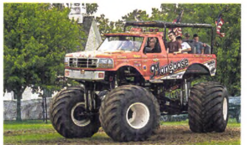
The Mongoose offers a thrill ride. Maybe not a great idea after eating a load of BBQ.