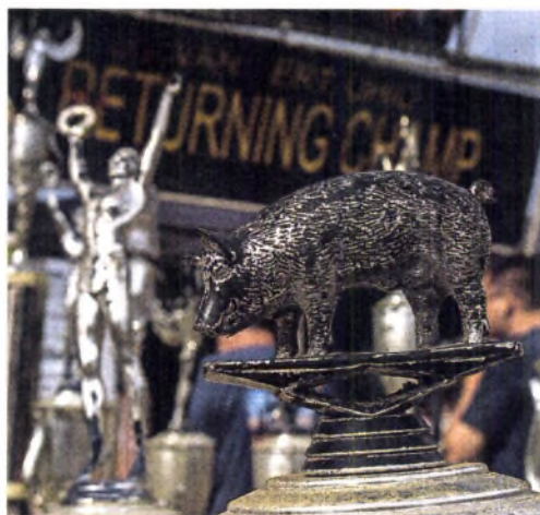
Smoke Shack has won a few awards.

Ultimate Fun Productions puts on several events across Michigan, including Burgers and Brews Bash in Royal Oak and Brews BBQ Bourbon in Grand Rapids. The event was also produced by Real Detroit Events.