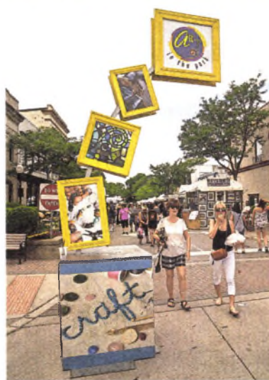
Late afternoon brought crowds to Art in the Park, in spite of steamy temperatures.